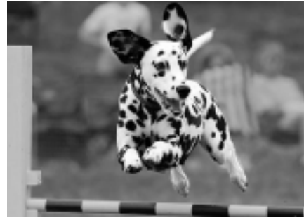
Bursting with the controlled energy that is his heritage, this Dalmatian sails over a jump in agility competition.

Historically, responsible breeders who produced purebred dogs were appreciated for their dedication to a particular breed or breeds and for their efforts to produce mentally stable, physically healthy dogs suitable as pets, companions, and working partners. In their pursuit of excellence, these long-time breed enthusiasts and their protégés continue to build a body of knowledge about the dogs they love and to work hand-in-hand with scientists and behavior