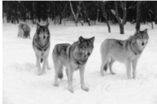
Wolf packs have grown from the 66 animals transplanted into the northern Rockies in 1995-96 to more than 1700 individuals in 242 packs at the end of 2009.

"Once again, I will state that elk are not flourishing where wolves are present," Allen wrote. "Contrary to what you have suggested many times, to claim otherwise is disingenuous and 'cherry picking' data. Elk populations are being exploited at a high rate by predators, primarily wolves and