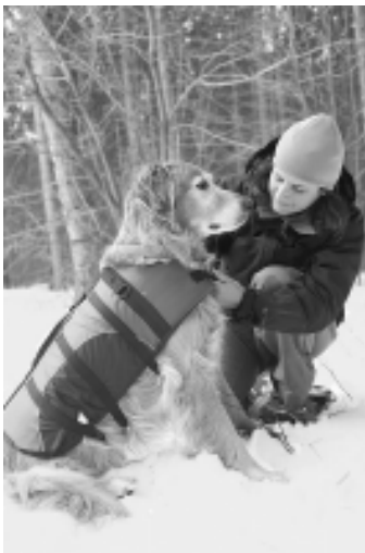
Their superior sense of smell and their huting ability help Golden Retrievers search for lost hikers.

Even so, the assault on purebred dogs has been relentless, resulting in dramatic reductions in numbers, especially in rare breeds. Extremist organizations such as the Humane Society of the US and its affiliates and People for the Ethical Treatment of Animals have stepped up their advocacy of policies such as mandatory sterilization, bans on tradi-