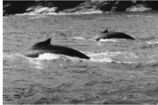
No hunting of humpback whales would be allowed in the IWC proposal to loosen restrictions on hunting some other species.

The quotas would have specified the number of each species that could be killed without requiring a nation to hide behind exceptions to the 1984 moratorium. Domestic use of whale and other products would be allowed, but international sale would continue to be prohibited. Whaling ships would be required to carry an observer to make sure quotas and other requirements were adhered to. And only nations that hunted whales in 2009 would be allowed to hunt for the 10-year duration of the agreement.